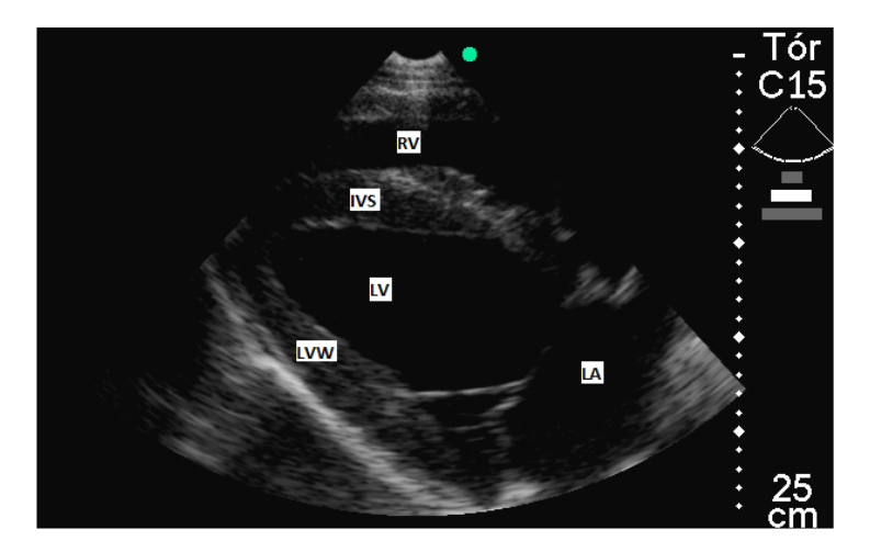
Figure 3 - Echocardiographic B- mode image showing the major axis of the four chambers of Quarter Horses, obtained from the parasternal right window. LA: left atrium; IVS: interventricular septum; RV: right ventricle; LV: left ventricle. LVW: left ventricular wall. Depth 25 cm.