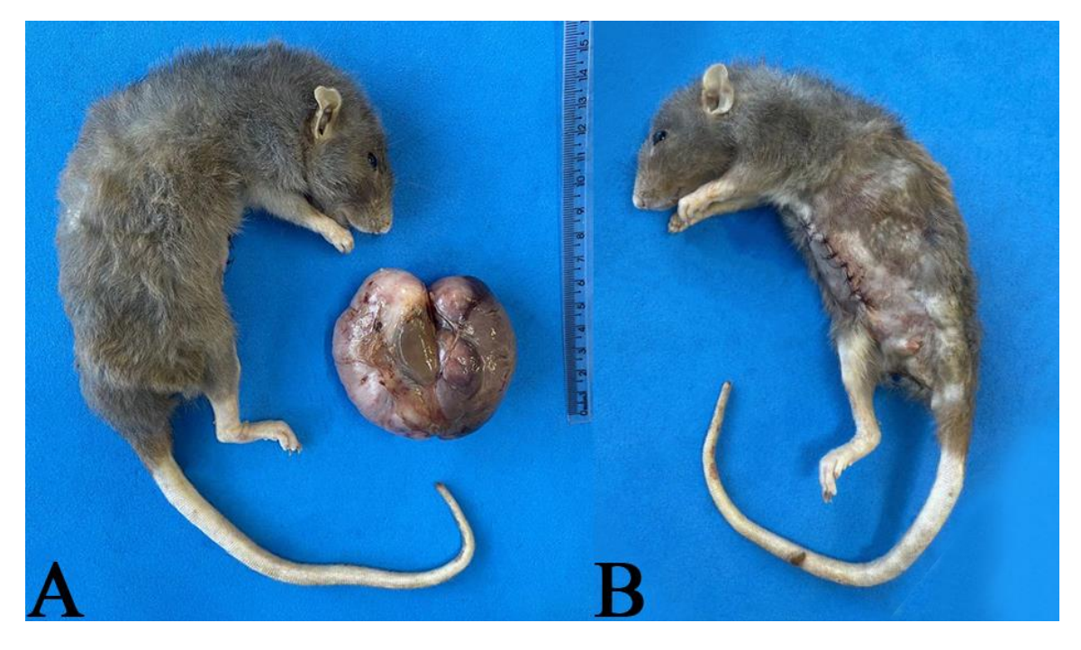
Figure 1 - Necropsy of the <u>Rattus norvegicus</u> with the (A) presentation of the neoformation with the left kidney and adrenal intacts in the center of it and the (B) surgical points at the site of access to the abdômen. Note the absence of the right pelvic limb

In December, a 3-year-old Wistar rat, male, exhibited a nodule in tibia/fibula on the of the left pelvic limb measuring 4,3cm x 4,0cm, round, firm, whitish, adhered to the musculature, but without bone involvement. The limb was amputated and the morphological diagnosis was suggestive of Myxoid Sarcoma. Five months later, the animal presented a nonadherent left medial abdominal neoformation measuring 6 cm in ultrasound scan. It underwent surgery to remove this new formation but unfortunately died. The Wistar was submitted to the necroscopic procedure (Figure 1A and 1B). In this avaluation, the Wistar rat had a regular, firm, smooth, whitish, round nodule measuring 7.2cm x 7.0cm x 4.2cm on the left kidney and adrenal gland.