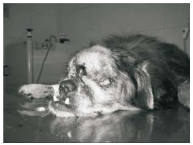
Figure 1 – Photographic image of a dog with nasal TVT showing facial tumefaction with ulceration and bilateral mucous and purulent discharge.