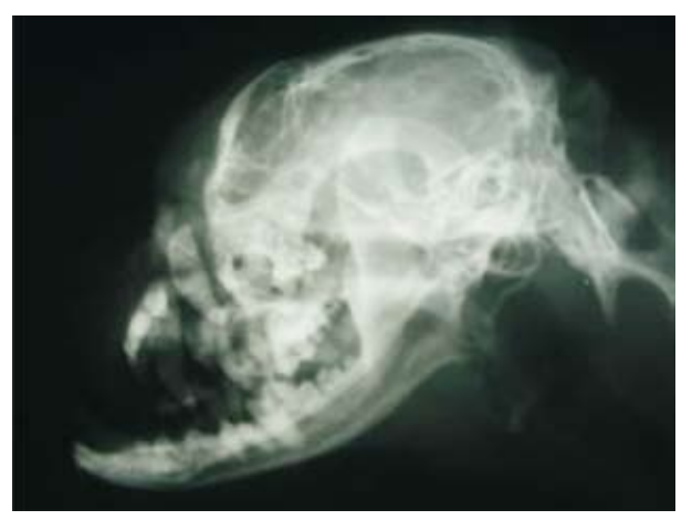
Figure 2 – Lateral radiography of a dog's cranium with nasal TVT. Notice the increase in the soft tissue density, lysis of the nasal and paranasal sinuses and dental dislocation.