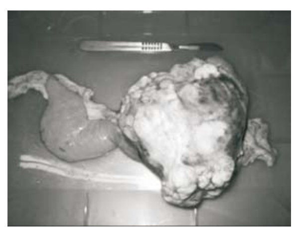
Figure 5 – Photographic image of the spleen of a dog with metastasis of TVT, with presence of presence of amorphous mass and esplenomegaly.