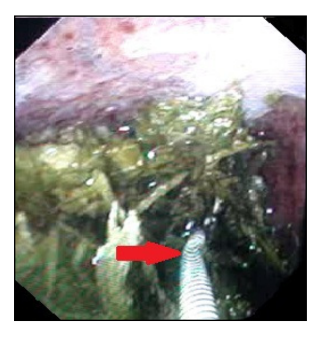
Figure 1 – Video endoscopic image of ingesta impaction in the thoracic esophagus, performing the desobstruction procedure with alligator forceps (red arrow).